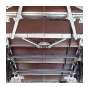
Chassis & floor

It's the attention to detail of Ifor Williams trailers that makes our products so popular with owners. Just take a look at these standard features.