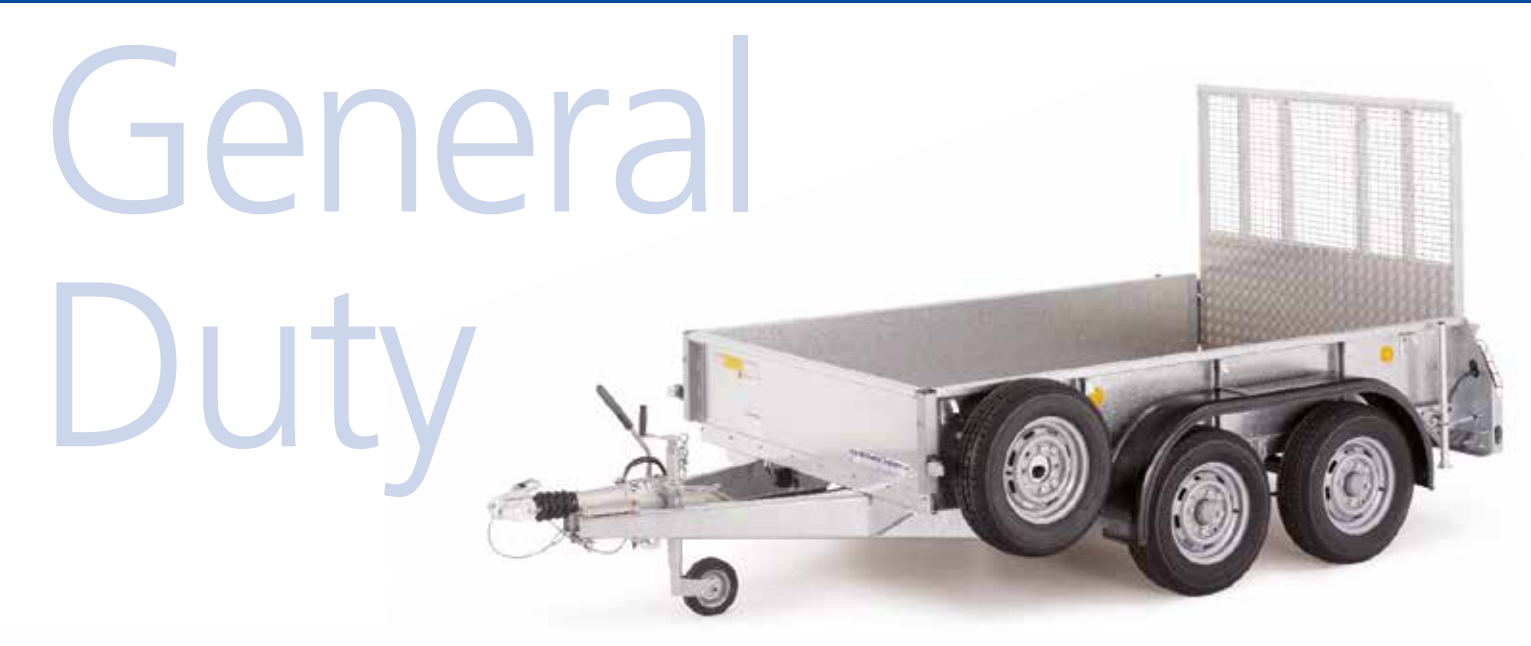
GD85 with ramp