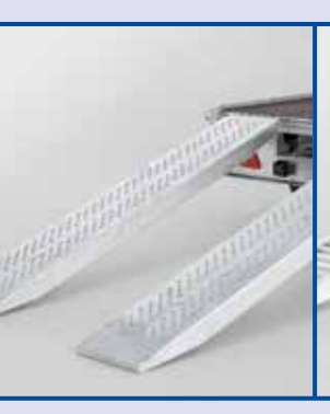
Perforated steel loading skids

Fitted to the GP and GX models, these are adjustable for width when deployed.