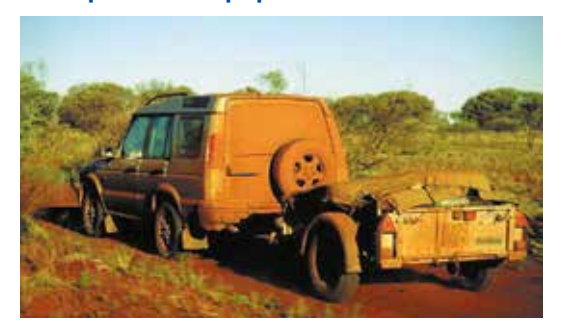
A GD64 at work in the Australian outback

Our General Duty trailers are at home in almost any environment, with virtually any type of load, from building materials to expedition equipment.